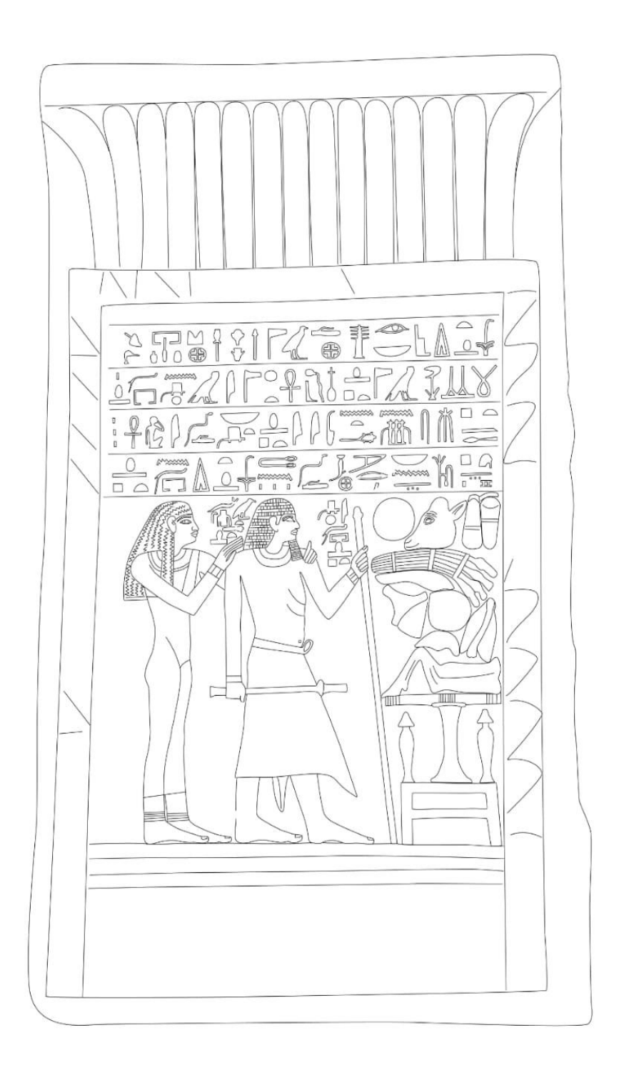
Fig. 1. A Facsimile of the stela of Hotep (by: Mina Zaghloul)