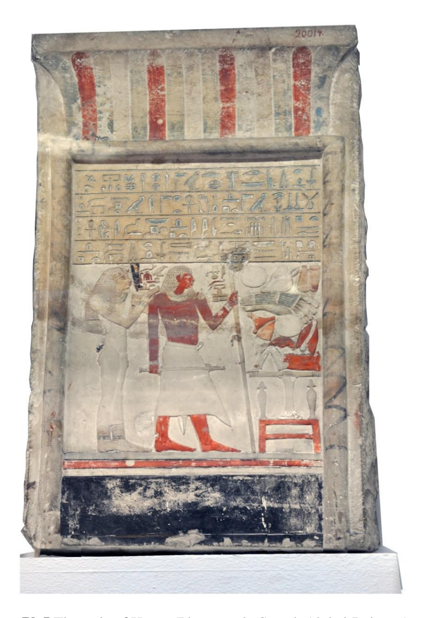
Pl. I The stela of Hotep